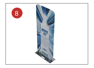
8. Completed Waveline Bannerstand