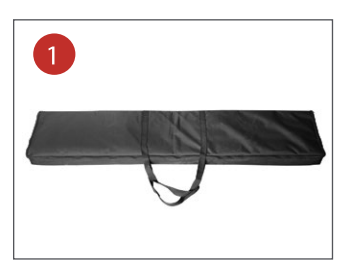
1. Waveline Bannerstand black padded bag.