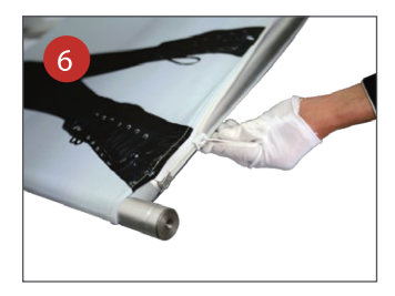
6. Zip the bottom of the graphic.