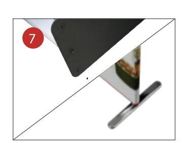
7. Attach base with provided screws -or- Attach feet option